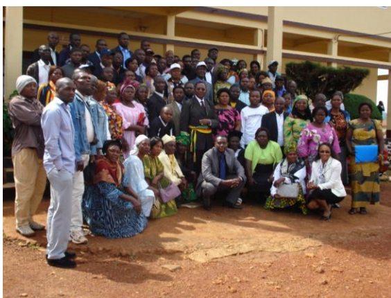
Effective training and networking opportunities: The workshop participants consisting of the Mayor, the AMICAALL Team and Municipal HIV Teams.

From 28 September to 1 October 2009, councils of Dschang, Bafoussam I, Bangangté, Bamendjou, Babadjou, Banwa, Ndemdeng, Foumban, Bangou and Bassamba in the Western Region were trained to utilize sensitization kits on key HIV/ AIDS services and strategies. The information kits focus on financial empowerment for women in order to meet the challenges of HIV/AIDS in their localities.