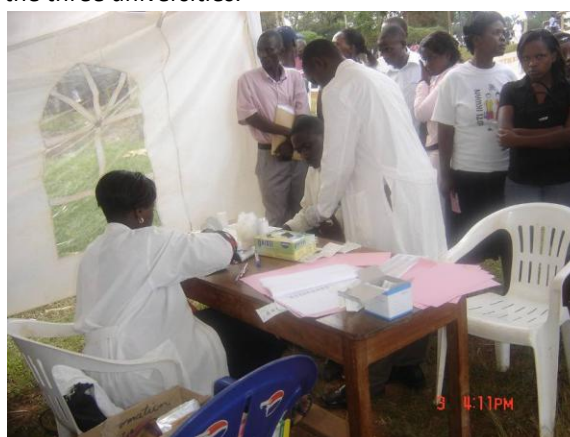
Kyambogo University students accessing HIV Counseling organized by AMICAALL Uganda

AMICAALL Uganda supported three Ugandan universities and an HCT service provider to conduct HIV Counseling and Testing for students. Initiating the service at the campuses has enabled many students to access HCT services as it was close to where they are every day. In addition, students felt free to confide in partners working outside than going to University medical centers where they are known. To date a total number of 1,273 students have accessed VCT services in the three universities.