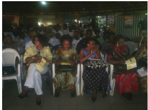
Participants were encouraged to improve the information flow on HIV/ Aids in local communities.

As every year by end of December AMICAALL Mali launched the "Week for local councillors against HIV/AIDS". The ceremony was chaired by the First Deputy Mayor of Bamako District. Present at the launch were representatives from municipal teams from the district and the region of Kayes, representatives of the High Council as well as representatives of traditional speakers. Overall the Alliance invited adults and youths from six communities. The objectives of this week are to allow local councillors to address as many people as possible to help alleviate the spread of HIV. Another objective is to encourage young people to know their status to be aware of the wide spread of HIV and Aids.