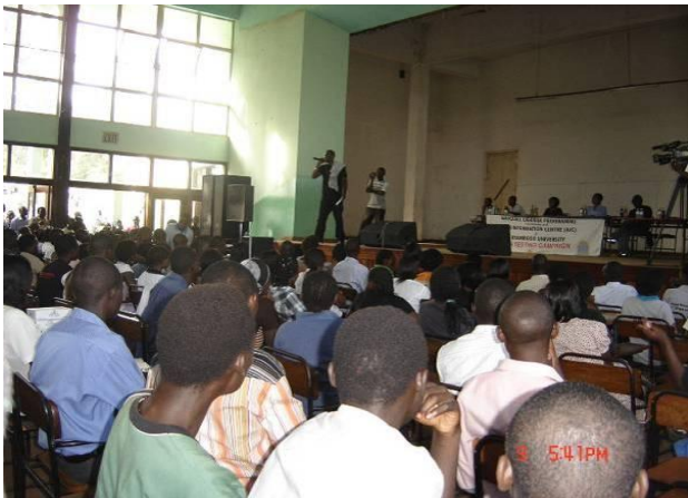
Youth friendly campaigns involving popular Ugandan musicians in Kyambogo University and Mbarara University of Science and Technology

Three Ugandan universities have been supported to conduct youth friendly HIV campaigns involving role models and celebrities in Uganda. The campaigns are an excellent mass mobilization strategy to reach students with information about HIV as well as giving HIV messages through edutainment (educational entertainment via music, dance and drama).