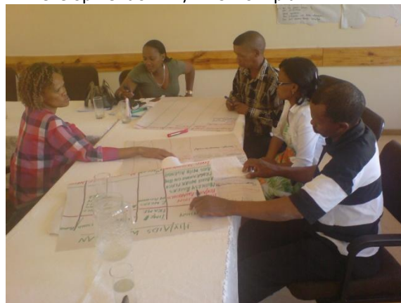
Local authorities from Berseba, Tses and Karasburg were trained by AMICAALL Namibia in November 2009