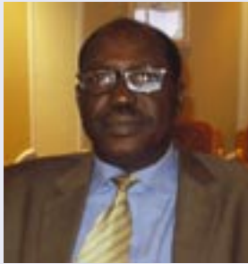
Honorable Abdel Kader Sidibe, Mayor Bamako III, Mali

By Mayor Abdel Kader Sidibe, Bamako III Mali