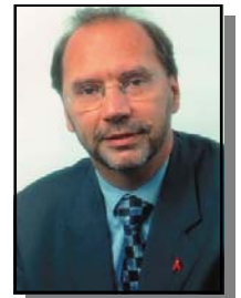
Dr Peter Piot, UNAIDS Executive Director

UNAIDS Executive Director Dr. Peter Piot, in his World AIDS Day 2006 message, noted that, there is "reason for concern and for some hope." According to UNAIDS, the number of new infections rose to 4.3 million and 2.9 million people died of AIDS-related illness in 2006. However, there is evidence, he stated, that there are declines in HIV prevalence among young people, between 2000 and 2006, in several countries.