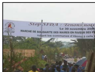
A banner to start the Solidarity March in Akono

To mark World AIDS Day 2006, local government authorities, with support from AMICAALL Cameroon and in collaboration with a wide range of partners and organisations, organised a solidarity march and a nation-wide media campaign. For more details, see the World AIDS Day section.